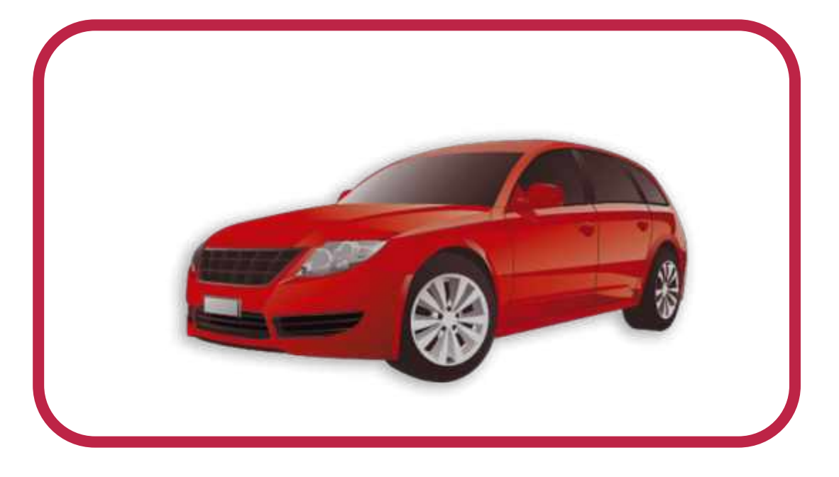
Video News – The 1<sup>st</sup> script

01 car experiencing character in a static context, no driving scenes