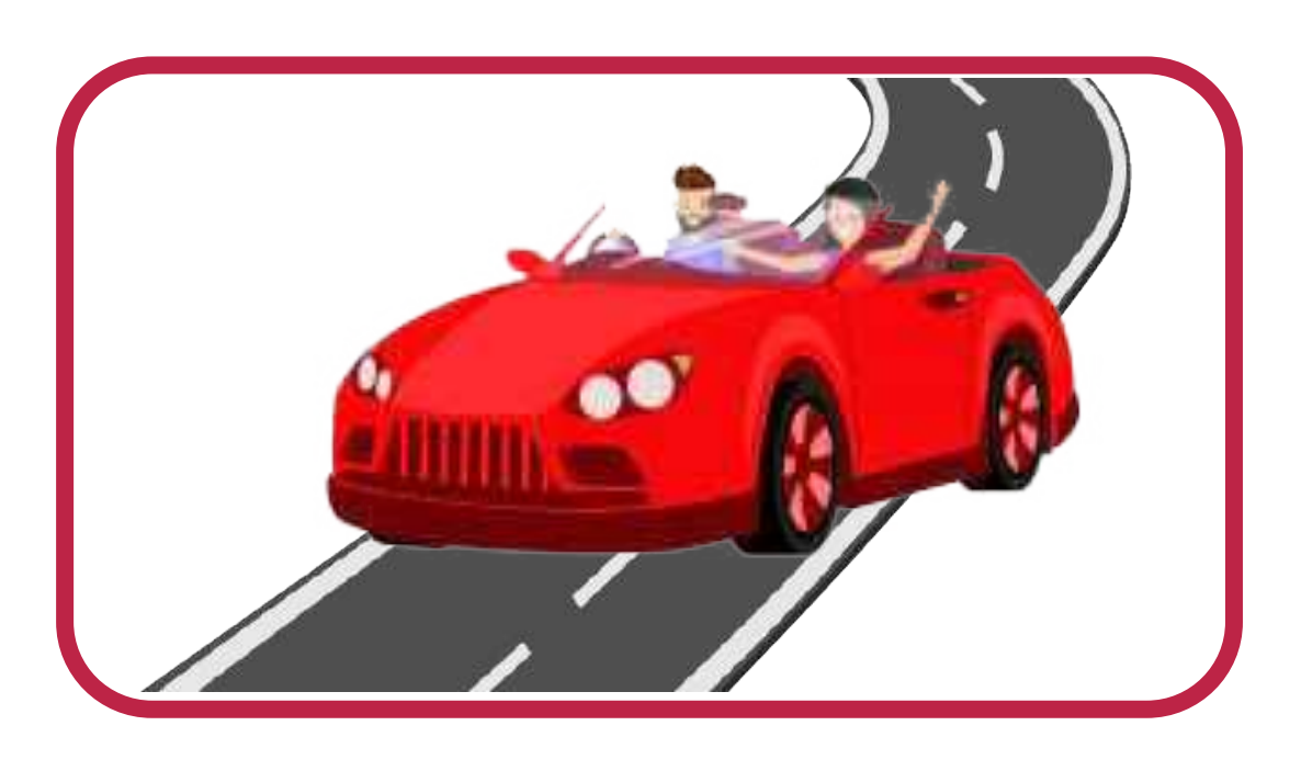
Video News – 3<sup>rd</sup> script

01 car experiencing character in a dynamic context, with driving scenes