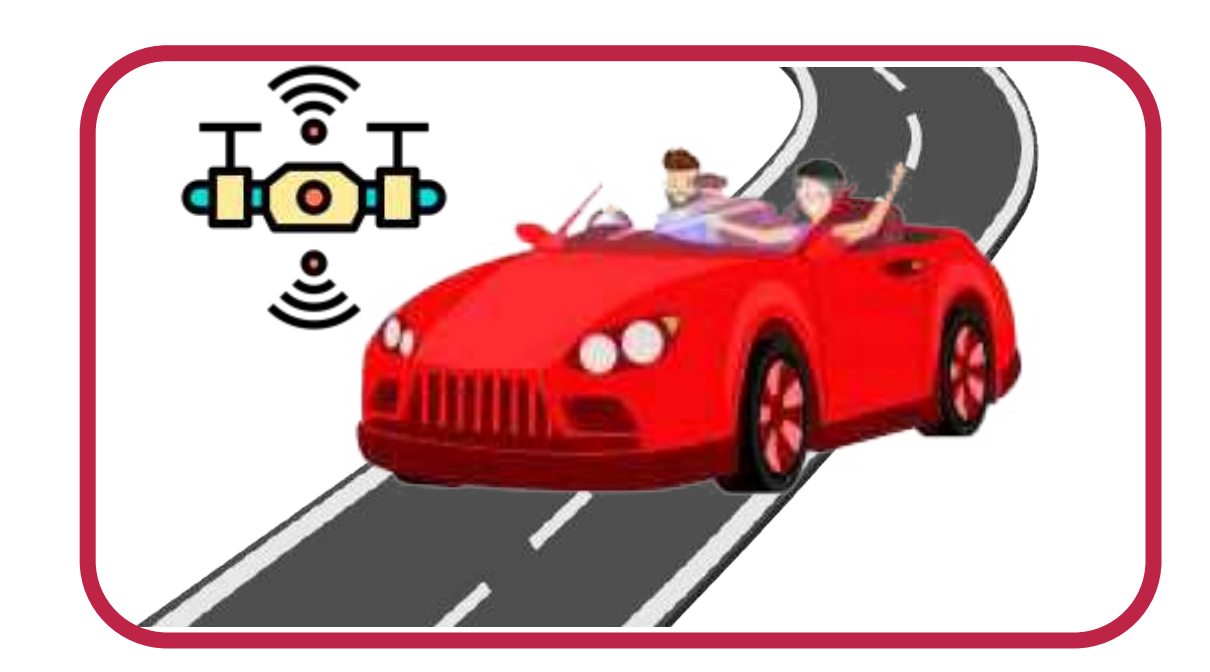
Video News – 4<sup>th</sup> script

02 car experiencing characters (02 journalists or 01 journalist + 01 guest) driving cars are put in a dynamic context