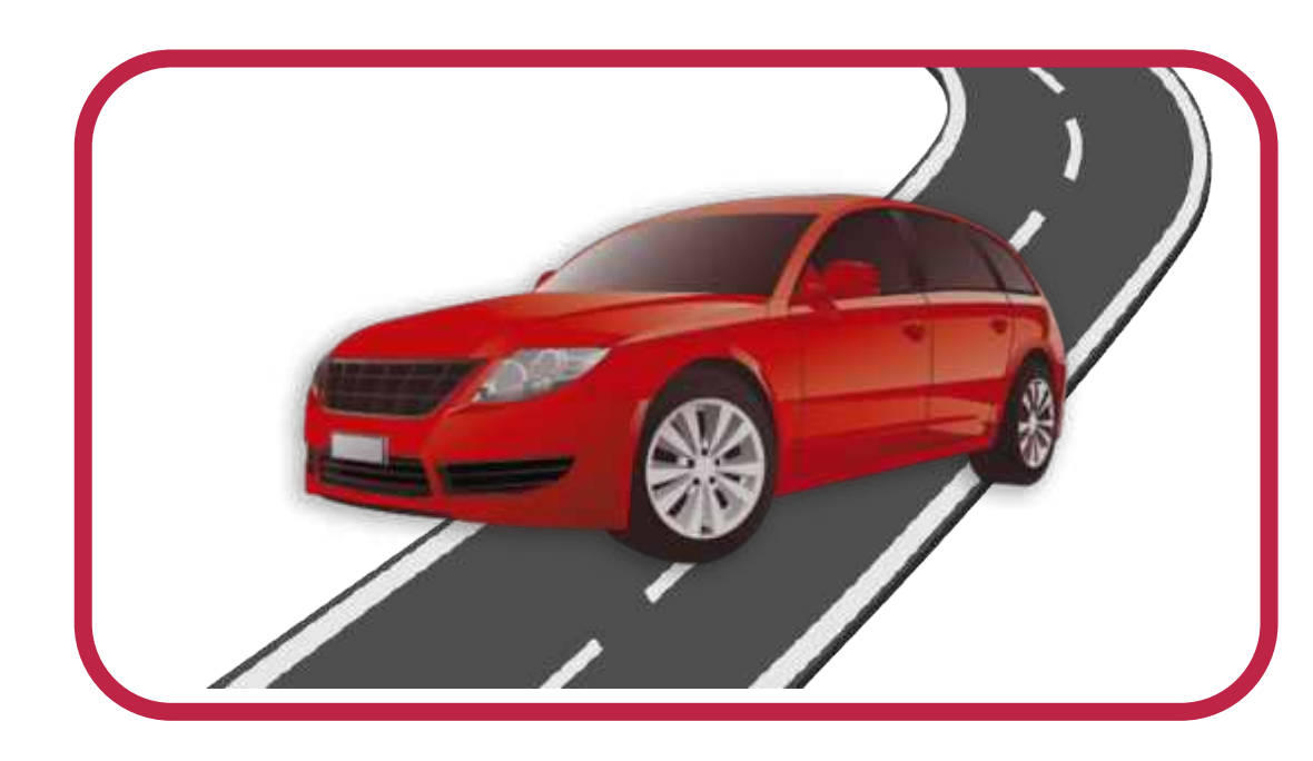
Video News – 2<sup>nd</sup> script

01 car experiencing character in a static context, no driving scenes