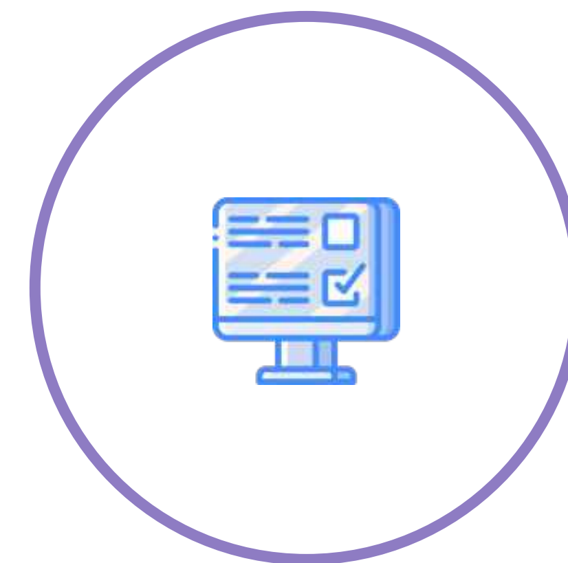
Readers Interactive Box

A hyperlink is a link to another landing page off the article site